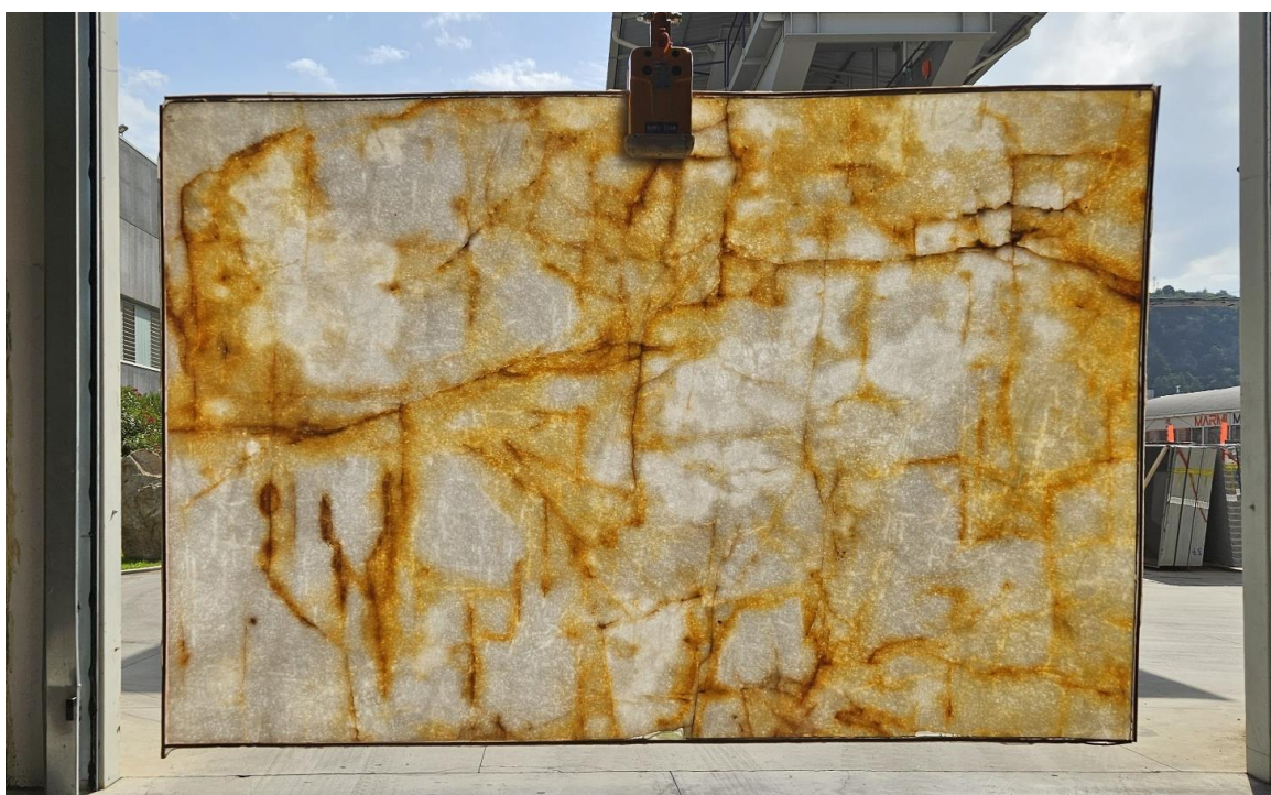
Back-lighted Cristallo Gold

The Brazilian quartzite Cristallo Gold is characterized by its great versatility as it is used to add an elegant and luminous touch to delicate environments such as kitchens and bathrooms as well as to floors, walls and cladding of indoor and outdoor spaces. Thanks to its transparency, it is also recommended as an back-lighted stone to create striking designer furnishings.